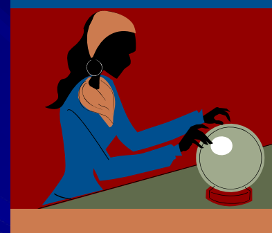
Oil Producing Countries